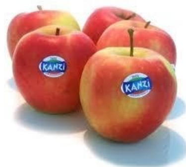
Figure 1. Mesenteric lymph nodes MLN) are located in the stomach (left). One kg of Kanzi apples (right).